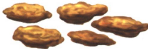
Type 5. Soft blobs with clear-cut edges (passed easily)