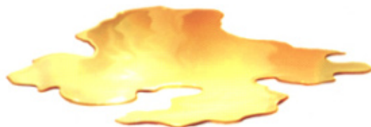
Type 7. Watery, no solid pieces, entirely liquid