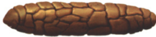
Type 3. Like a sausage but with cracks on the surface