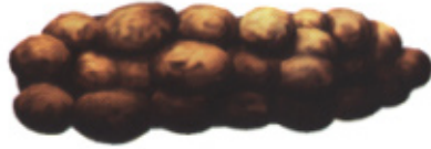
Type 2. Sausage-shaped but lumpy