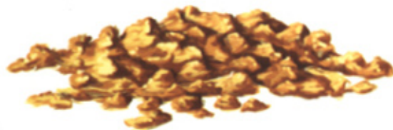
Type 6. Fluffy pieces with ragged edges, a mushy stool