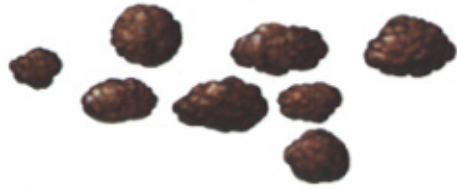
Type 1. Separate hard lumps, like nuts (hard to pass)